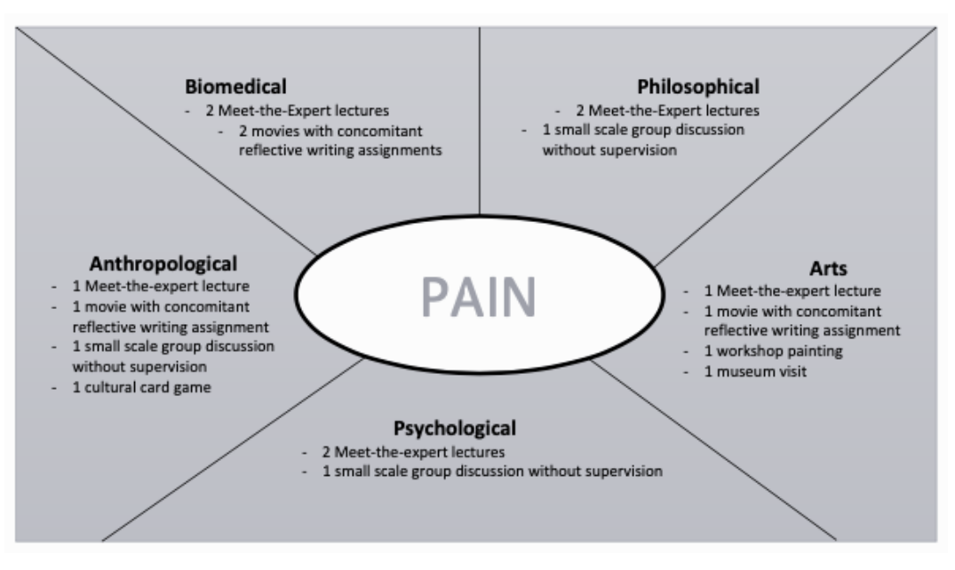
Figure 1. Overview of learning activities during the 10-week course.