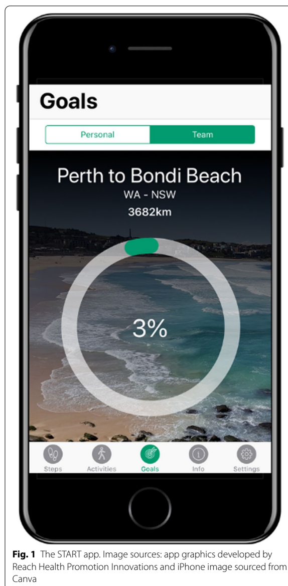
Fig. 1 The START app. Image sources: app graphics developed by Reach Health Promotion Innovations and iPhone image sourced from Canva

A main app feature included manual entry of daily step count. This feature was chosen as a means of implementing the BCT of self-monitoring [10, 34] and as it was not possible to integrate external step count data (e.g., from a Fitbit device) into the START app with the budget available for the app development. Another key feature was the team destination goal. Users could be allocated to a team, with each team able to select a destination to virtually walk to over the 16-week intervention. Virtual walks were categorized into easy, medium and hard difficulty level and based on group members individual baseline step counts, projected step count increases, and subjective walking pace and ability from initial group walks (calculations are provided as Additional file 2). Progress towards the