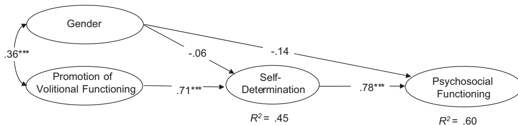
Figure 2. Structural model of relations between promotion of volitional functioning, adolescent self-determination, and adolescent psychosocial functioning (Study 3). Coefficients shown are standardized path coefficients. *** p < .001 .

The present set of studies yielded four primary findings. First, in accordance with our theorizing, exploratory and CFA indicated that two different operationalizations of perceived parental autonomy support can be empirically distinguished; that is, the promotion of independence (Steinberg, 1989) and the promotion of