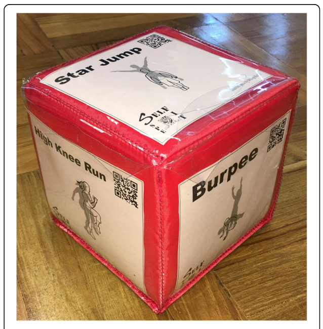
Fig. 3 The fitness dice with interchangeable faces

objective is to inject an element of game-play to fitness activities, and in turn increase students' enjoyment while engaging in such exercises. Specifically, we designed a set of dice with all six faces covered using transparent film pockets that can hold paper or other flattened contents (e.g., CD/DVD discs). Using this design, each face of a die will be interchangeable, and, therefore, can be customized to the needs of users (see Fig. 3). Put in the context of the current study, teachers will be able to insert activity cards provided by the research team and then create their own based on the i) skill and fitness levels of their students, ii) equipment available for their classes, and iii) activities favored by their students. In the long run, we will encourage teachers to invite students to choose, or to create, activities for the faces of